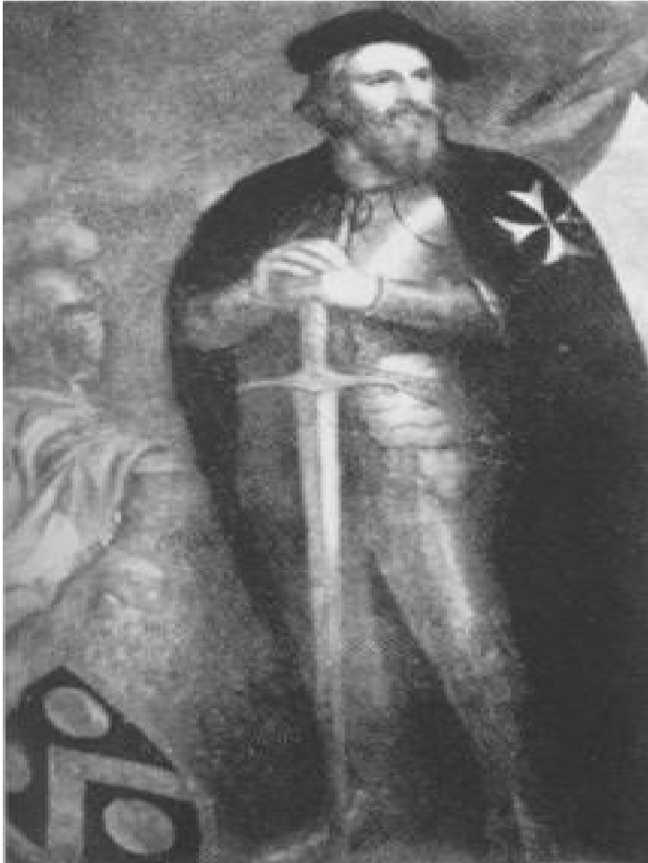
A Knight of the English Tongue from the Grand Master's Palace, Valetta

From the parent stem of what is today the Sovereign Military Order of Malta, headquartered in Rome, branched off in the mid-sixteenth century those Knights who accepted the Reformation of the Church. They grouped themselves around the historically independent-minded Bailiwick of Brandenburg. The present Order of St. John of the Hospital at Jerusalem (Johanniter) today has "commanders" or Associations in Germany, Austria, Hungary, Switzerland, France and Finland.