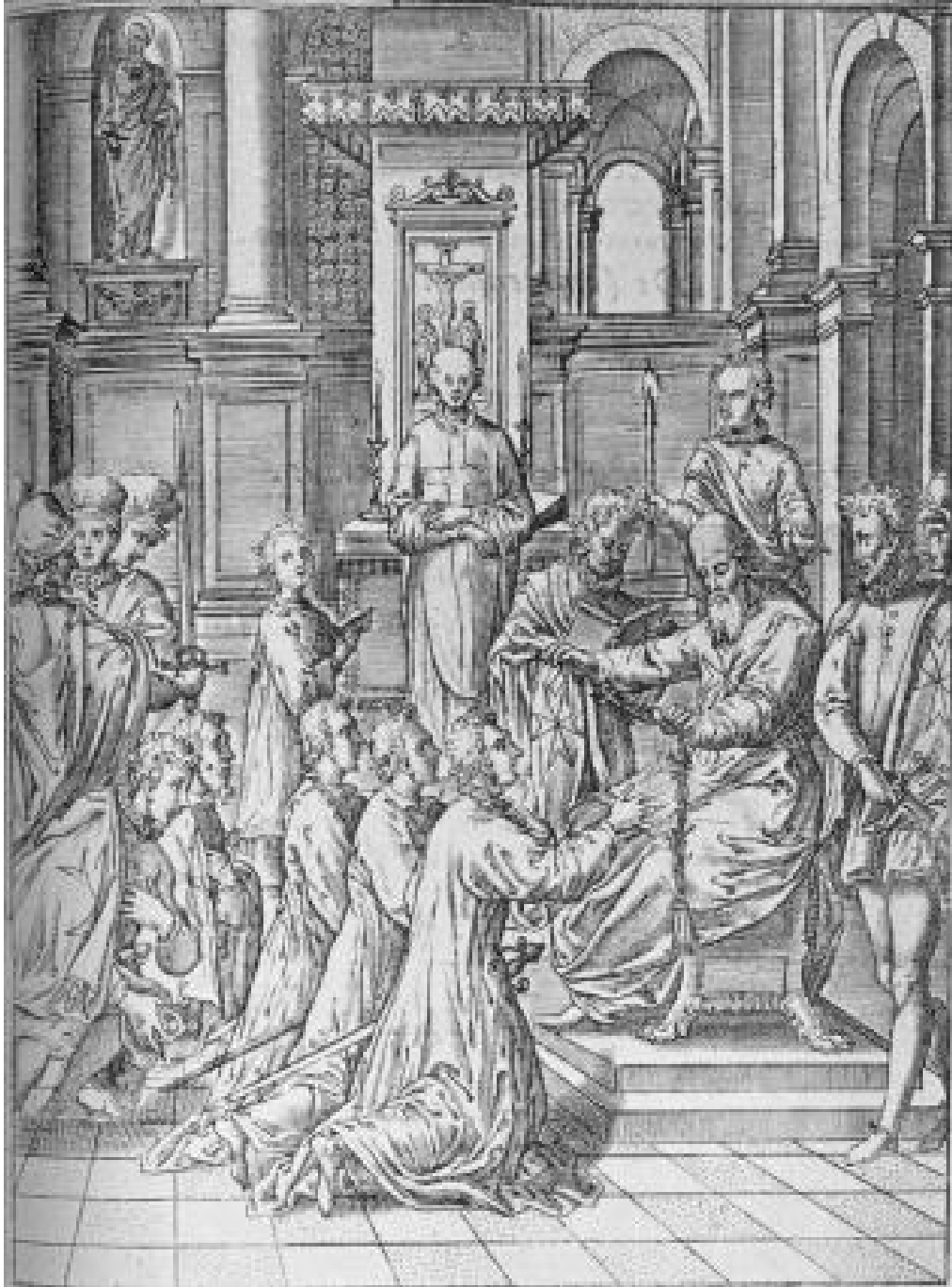
Reception into the brotherhood of the Knights of Saint John at Malta from an engraving: year 1586

granted them in 1530, under the suzerainty of the kings of Spain. The Knights of Malta (1530-1798) at once resumed the manner of life they had already practiced for two centuries at Rhodes.