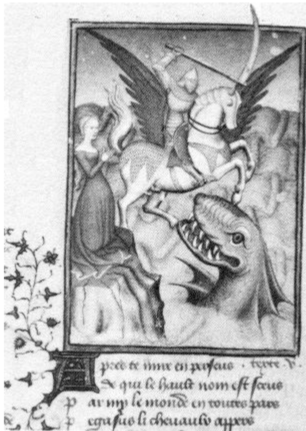
The Knightly Virtues: Rescuing a maiden in Distress (British Library, Harleian M.S. 443I, F. 98V)

The "Cross of Calvary" was later called the "Maltese Cross" and represented the principles of charity, loyalty, chivalry, gallantry, generousities to friend and foe, protection of the weak, and dexterity in service. During the Crusades, many knights became firefighters out of necessity. Their enemies had resorted to throwing glass bombs containing naphtha, rosin, sulfur, and flaming oil into the sailing vessels of war transporting the knights. Or lobbing the "glass bombs" (Molotov cocktails) at the troops. Many knights were called to do heroic deeds by rescuing fellow knights, and extinguishing the fires.