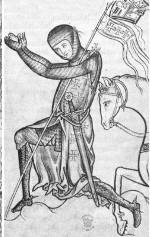
Twelfth Century armor: A Knight (Crusader) wears a surcoat over mail. A round helmet, a mail covering for his neck, (ventral) and mail stockings.

The Knights of St. John of Jerusalem gave Malta the heritage of the insignia of the fire service. It is the Cross Pattee-Nowy, or the "Cross of Calvary," otherwise known as the "Maltese Cross." This cross represents the fire service ideals of saving lives and extinguishing fires. It also represents the unselfish "public service" dedication to man and environment. And the inherent qualities that fire departments and public safety personnel around the world hold such as; charity, loyalty, chivalry, honesty, integrity, honor, pride, gallantry, generosity, commitment, dedication, selflessness, discipline, protection, devotion, ethics, dignity, and dexterity. The fire service borrows the cross from the "Knights of Saint John the Baptist of Jerusalem," a charitable, non-military organization that began their existence during the 11th and 12th centuries.