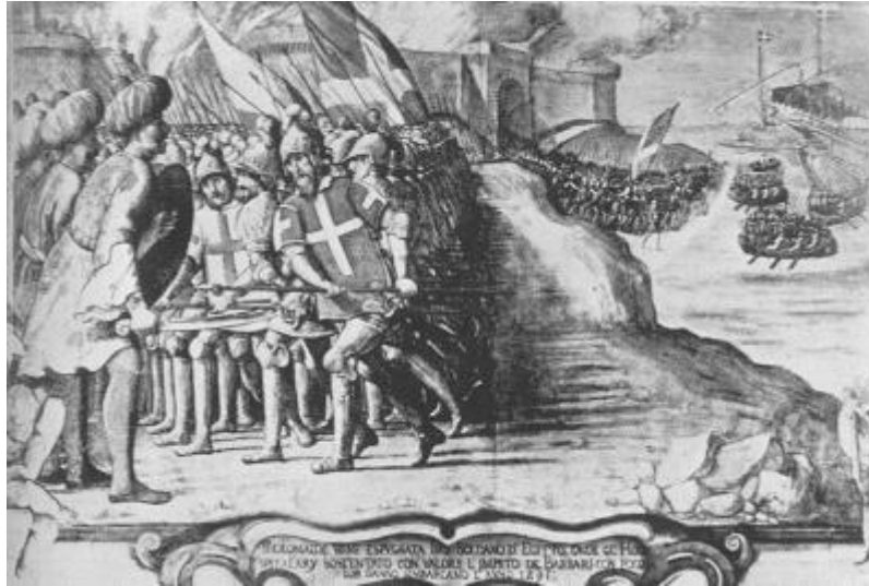
The fall of Acre in 1291. The Knights of Saint John form the rear guard and hold back the Mamelukes while the Christian survivors of the siege embark on the ships.

The Knights of Rhodes (1309-1522) The Knights of Rhodes, the successors of the Hospitallers of St. John, were distinguished from the latter in many ways. In the first place, the grand master of the order was thenceforward a temporal sovereign in that island, which constituted a true ecclesiastical principality, under the nominal suzerainty of the Emperors of the East. Secondly, although Villaret's first care was to build a new infirmary, the care of the sick took a secondary place, as the members of the order had scarcely occasion to devote themselves to any save the members of the community. The name knights then prevailed over that of hospitallers.