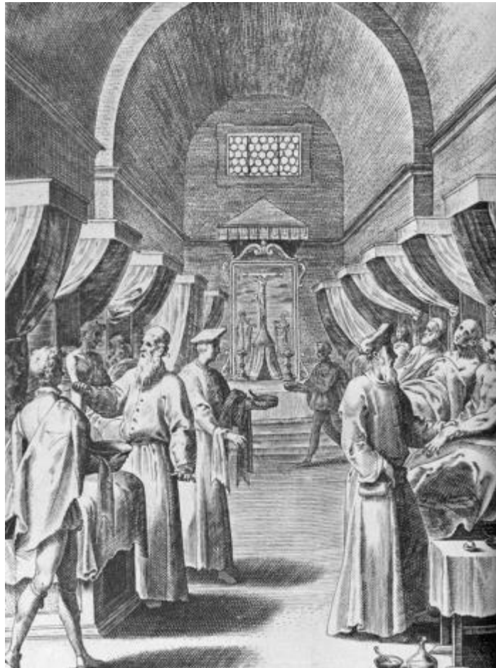
The sacred infirmary in Valetta with Knights treating patients

naval services and serves valiantly in many battles, including those of Acco, Rhodes and Malta.