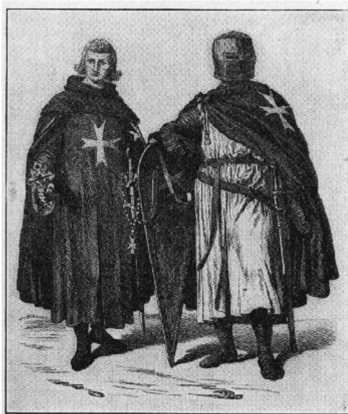
KNIGHTS OF ST. JOHN OF JERUSALEM

The Hospitallers had St. John the Baptist for their patron.