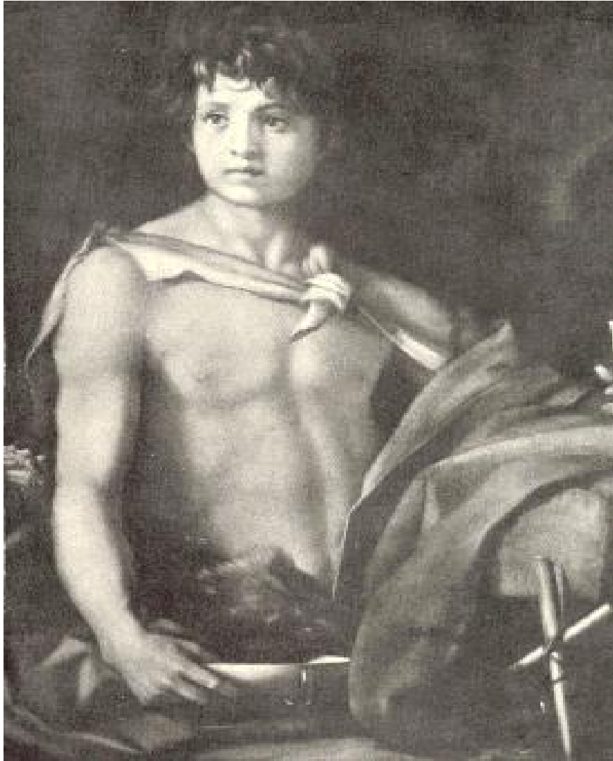
Saint John The Baptist

The Birth of Saint John The Baptist with his father, Zechariah, writing his name on a tablet from the Patzak Hymnal of 1335 (ms. 1578, fol. 179) The Knights of St. John, The Baptist, of Jerusalem, now commonly known as the Knights of Malta, can trace their origin to a group of monks attached to a hospice built in the Holy Lands in Jerusalem to aid travelers visiting the Holy Land. The monks were known as the Freres Hospitaliers de St. Jean de Jerusalem or The Knights Hospitalers Saint John. Their mission: "to care for our lords sick and our lords poor."