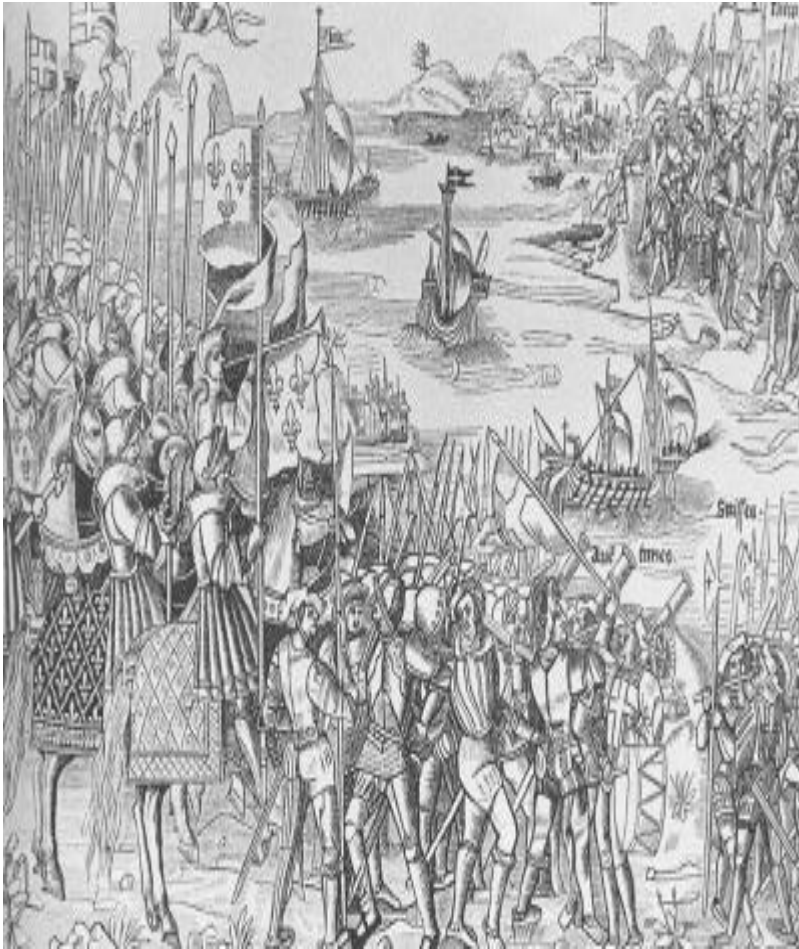
The capture of Damietta by St. Luis, 1248 with the ships of the Order in the harbor